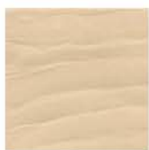
Sabbia Thar Beige