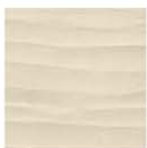
Sabbia Salar White