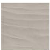
Sabbia Gobi Grey