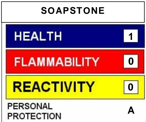
Hazardous Materials Identification System (U.S.)

[May be required by the OSHA Hazard Communication standard {29 CFR 1910.1200 (f)}, and applicable state and local regulations]