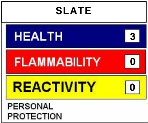
Hazardous Materials Identification System (U.S.)

MATERIAL IDENTIFICATION SYSTEMS – HAZARD LABELING [May be required by the OSHA Hazard Communication standard {29 CFR 1910.1200 (f)}, and applicable state and local regulations]