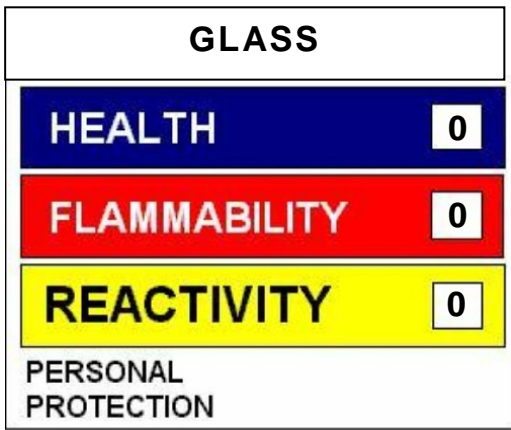
Hazardous Materials Identification System (U.S.)

[May be required by the OSHA Hazard Communication standard {29 CFR 1910.1200 (f)}, and applicable state and local regulations]